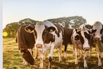
Separated cattle and pig liquid manure