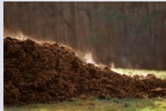
Cattle and pig manure